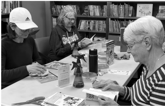
Pictured: Volunteers clean and restore books at SMART's Bend office.

To learn more about our Book Bank model, visit www.SMARTReading.org/book-bank/ .