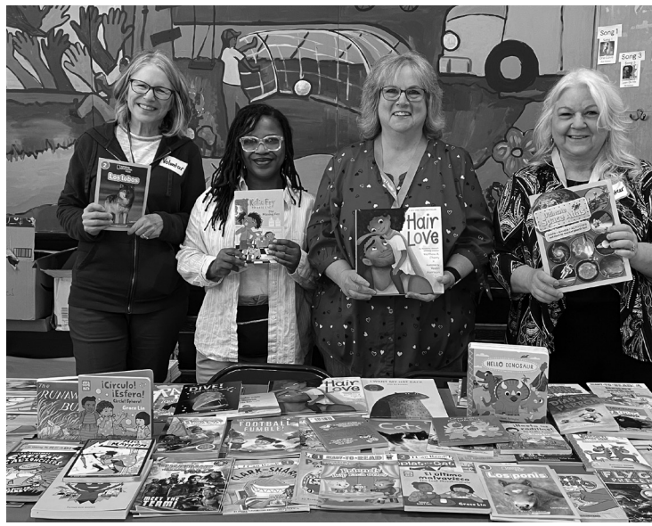
Pictured: Staff and volunteers give away books during the Free Book Fair at Grant Community School in Salem.