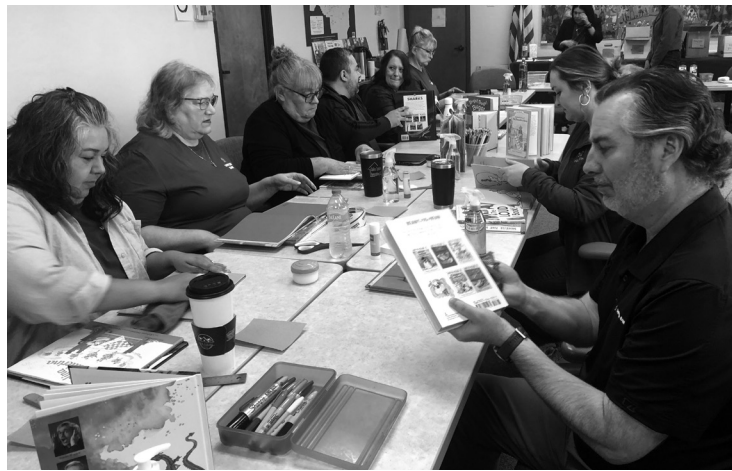
Pictured: Umpqua Bank employees clean books for SMART as part of United Way of Lane County's Days of Caring.