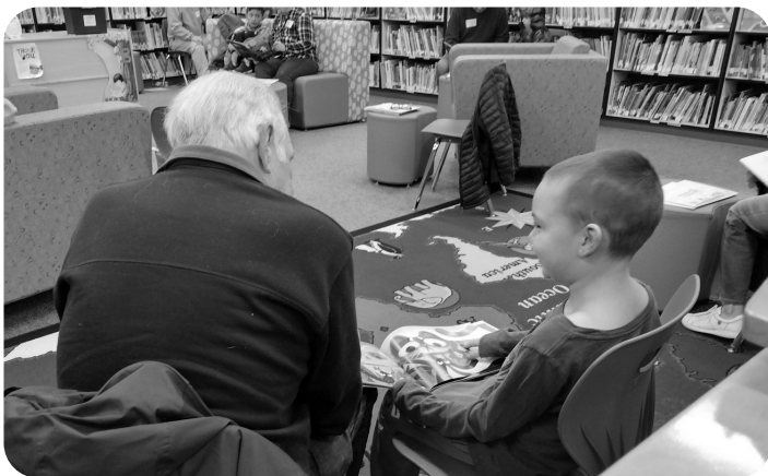
Pictured: Reading session at Pacific Ridge Elementary.

Our incredible community of 35 volunteers spent 497 hours this year reading with kids and helping them choose new books to keep. We're so grateful for the volunteers, donors, educators and partners who made it possible for us to return to in-person reading, give away hundreds of books, and inspire a love of reading in local kids. Thank you for being an important part of SMART Reading!