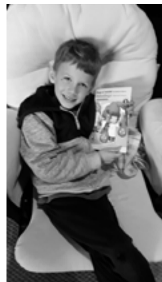
A student at Jewett Elementary in Central Point proudly shows off one of the books he received from SMART Reading.