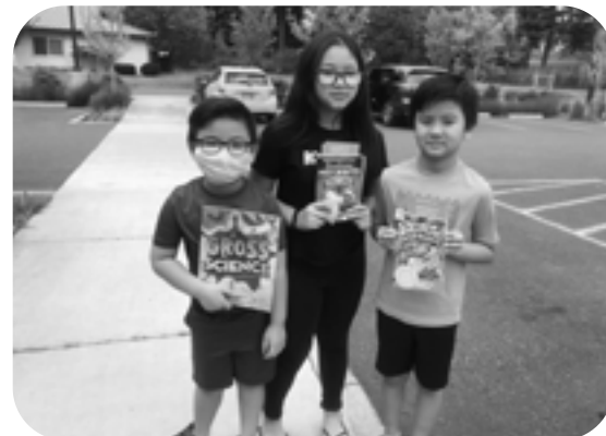
Students at the Boys and Girls Club in Portland show off the new books they received from SMART Reading last summer.