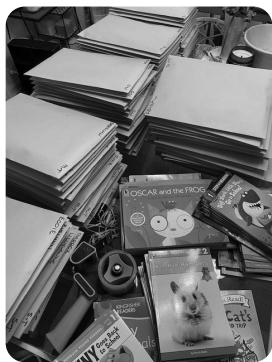
Our team assembled book packs to be sent home with kids in local schools.

This spring, despite school closures, we were still able to distribute more than 2,300 books to local kids at 13 SMART Reading sites. We know that access to books outside the classroom is a critical component of early literacy development and we're so grateful to be able to work with our schools and partner organizations to ensure kids continue to have access to new books to read and share with their families.