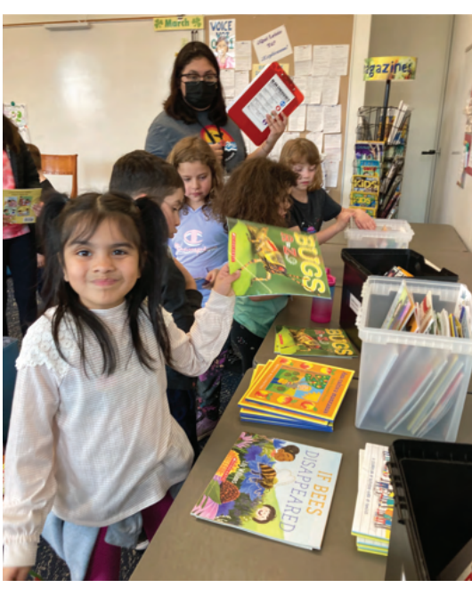
Pictured: Students selecting books to keep at Lincoln Elementary in Corvallis.